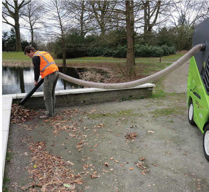
Flexible Wander hose